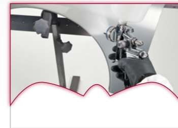
Field of vision CompactMask

Less mask, more view The horizontally shaped integrated filters give an exceptionally wide field of vision.