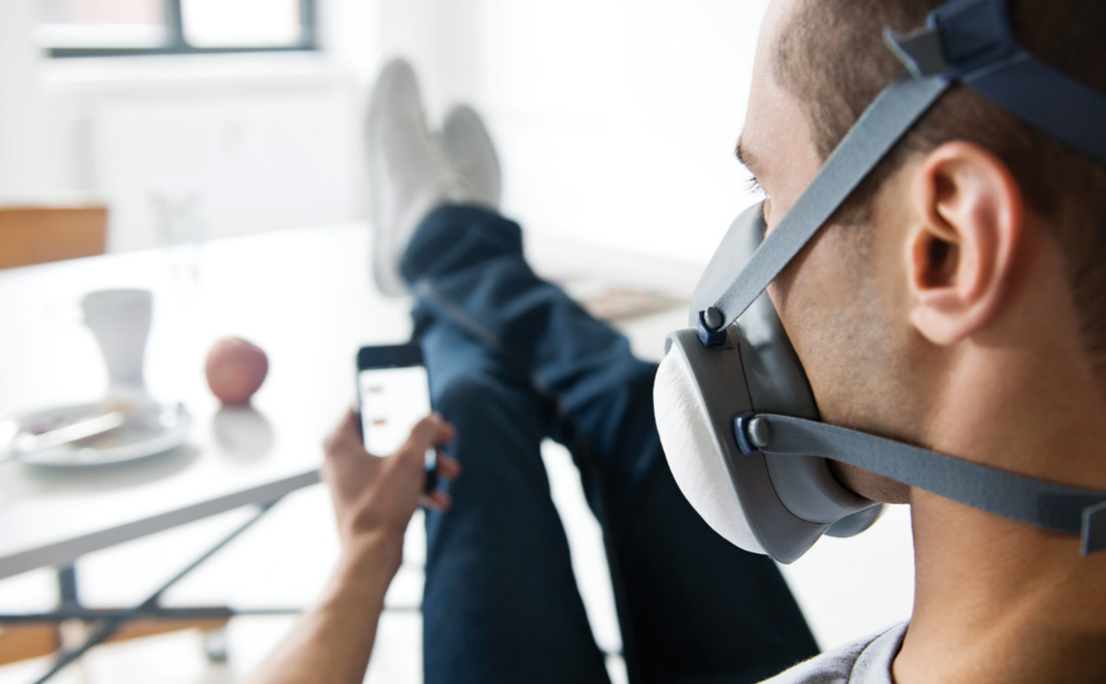
FlexFit - comfortable fit