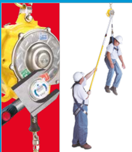
Fall Arrest Mode Assisted Rescue by Hand

Traditional assisted rescue operations may also be conducted.