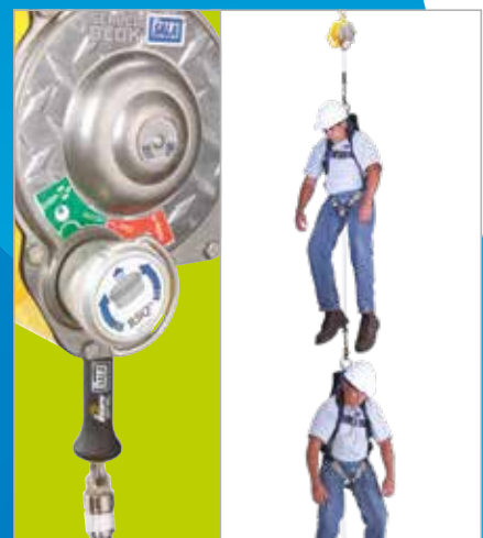
Automatic Descent Mode Self Rescue Descent