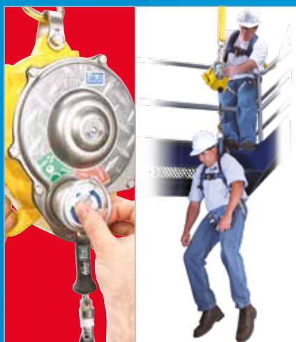
Fall Arrest Mode Assisted Rescue by Hand